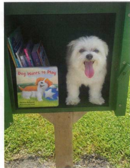
Louis promotes the United Way's Little Free Libraries.