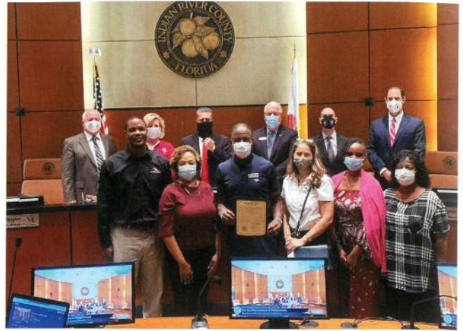
The Lights on Afterschool Proclamation by the county commission