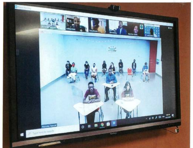
A Zoom view of the Lights on Afterschool event